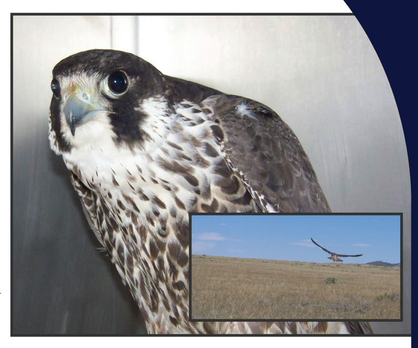
This Peregrine lifted its wings to a full recovery

How can you help? Help us restore our depleted resources and buy more bandages and medicine for the next bird with an injury. Go to www.rmrp.org to help us out.