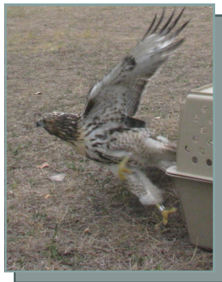
Above: This Red-tailed Hawk admitted in 2016 had both West Nile Virus and a fractured shoulder. She went on to be released.

Do You Know How Many Patients You Helped?