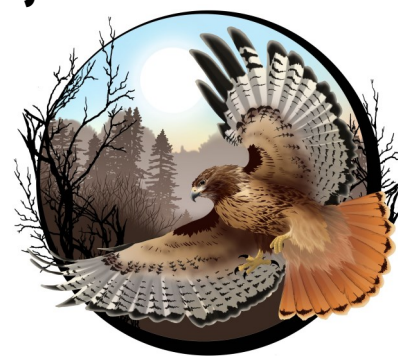
Thank you for making this event the best ever!

Mark your calendars for our 25th Annual Gala to be held on February 24th, 2018!