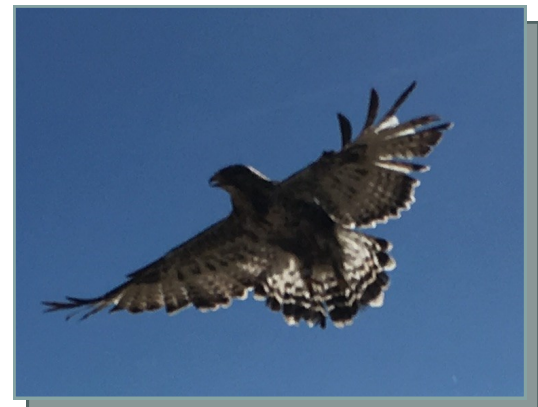
Whole once again, the hawk soars free thanks to the hard work of our staff, volunteers and supporters.