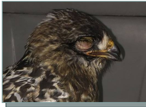
This Rough-legged Hawk was found in the middle of a busy road with severe wounds and head trauma.

Your donation, no matter what size, saves lives. His recovery is proof of your compassion. Thank you for standing with the RMRP.