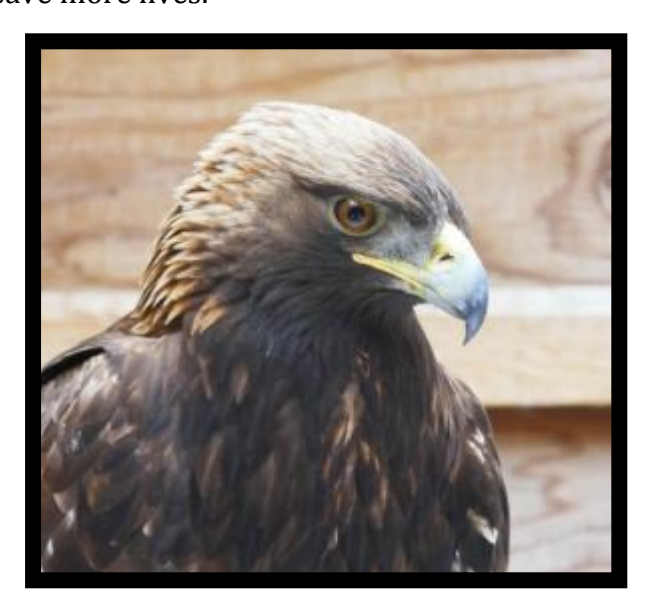
Above: This Golden Eagle was transferred to the RMRP from the Teton Raptor Center for flight conditioning and flight testing.

Through the help of our friends we can all save more lives.