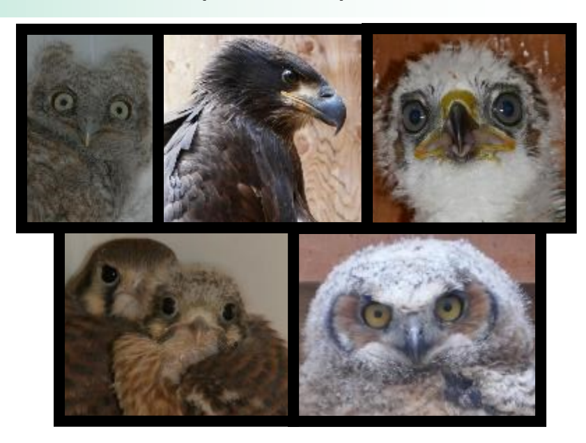
Above: All of these young raptors were rescued by the RMRP this spring and summer. All will grow up in our care before they are released to the wild.

The phone is ringing off the hook! It's the time of year when young raptors are the most active, and make up the highest percentage of admissions. About 50% of our annual caseload is hatch-year raptors that need our help.