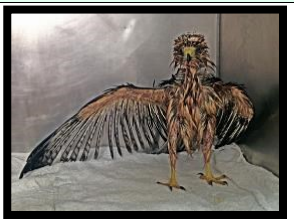
Above: New interpretation of the MBTA will mean RMRP patients, like this oiled Swainson's Hawk, will not have legal recourse. More birds can be injured by the same oil waste pits without the companies having to change a thing.

Establishment of a Federal prohibition, unless permitted by regulations, to "pursue, hunt, take, capture, kill...possess, offer for sale, sell, offer to purchase, purchase, deliver for shipment, ship, cause to be shipped... or export, at any time, or in any manner, any migratory bird, included in the terms of this Convention... for the protection of migratory birds... or any part, nest, or egg of any such bird." (16 U.S.C. 703)