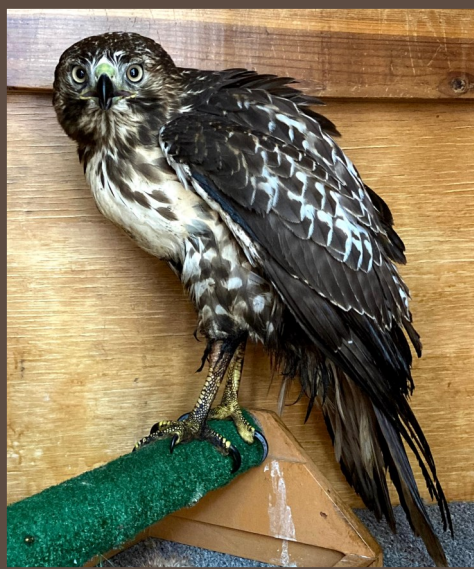
Right: Young hawk after several baths to remove tar. His legs are still tar stained from this terrible ordeal.