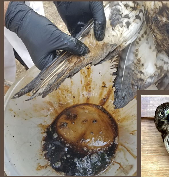
Above: Canola oil as well as Dawn soap and water to remove tar from this Red-tailed Hawk's feathers. What a nasty bucket full of yuk!

To support this hawk and other like him, you can purchase items from our wish list—like Dawn dish soap! Find it at www.rmrp.org/donate/wish-list . Click on the Amazon link if you like to shop online!