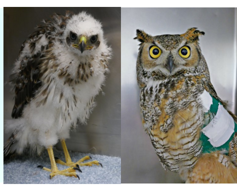
We used $150 in bandages. Can you help purchase more?