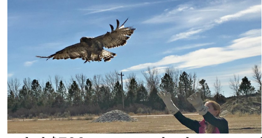
I needed $700 surgery to heal my wounds. Can you make sure more raptors like me get the surgery they need?