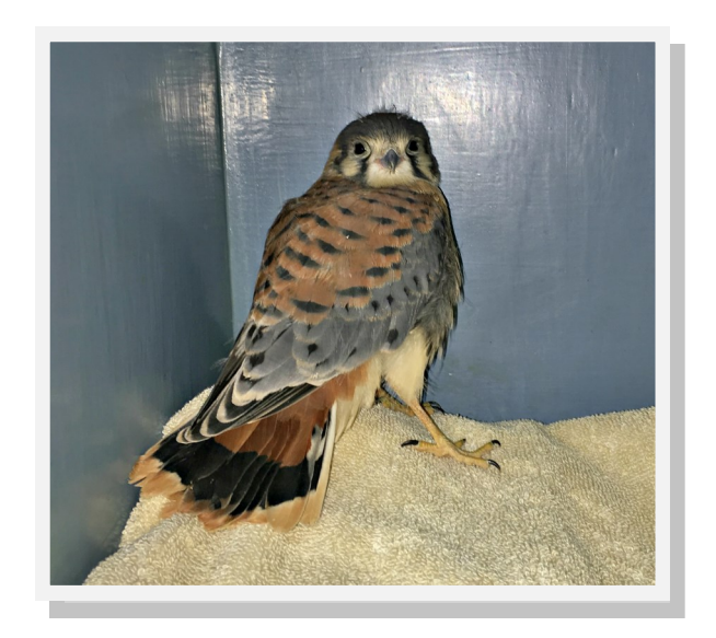
His leg was a bit abraded and painful from the twine tangled around it, but the fledgling Kestrel was otherwise unharmed.

He headed out, not knowing just what this rescue would entail.