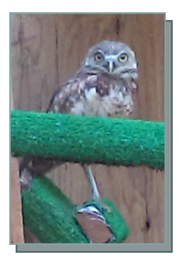
Left: The Burrowing Owl that was caught in barbed wire is doing so well! YOUR donation saved his life!

We are so happy to report that he is doing really well! His wound is completely healed. He has missed winter migration, so he will be with us until next spring.