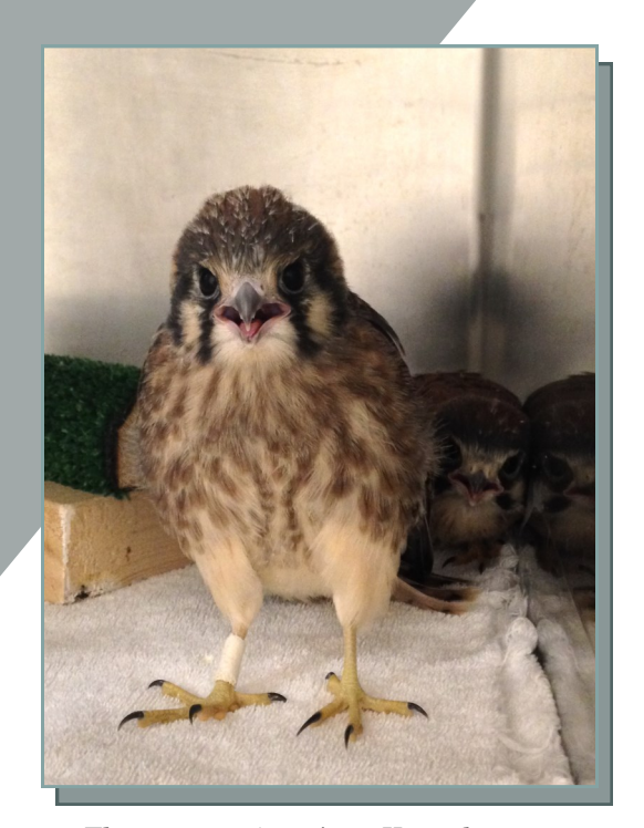
These young American Kestrels were abducted! Some young birds just need time to learn their adult skills.

The Rocky Mountain Raptor Program is a 501(c)3 nonprofit organization. We strive to inspire the appreciation and protection of raptors and the spaces where they live through excellence in rehabilitation, education, and research.