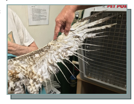
Your gift provides the high quality food he needs to grow new feathers.

Methane flares are very dangerous for birds. Since the flames are not always on, birds like to sit on the tall towers to survey the area. Then, when the towers flare, the birds are burned.