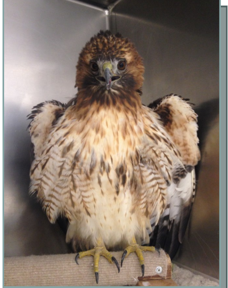
This Red-tailed Hawk is suffering from thirteen pellet wounds. Your donation will save his life.

Change comes from education, from the effort each of us take to make the world a better place. You can change the world by supporting the RMRP and our efforts to keep these amazing creatures in the skies.