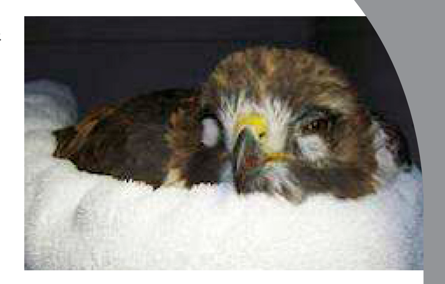
Day 1: A Red-tailed Hawk recovers after being hit by a truck.

Only a few short months after its near death experience, this bird was released back into the wild. We hope he goes on to make lots of babies just as hearty as he is!