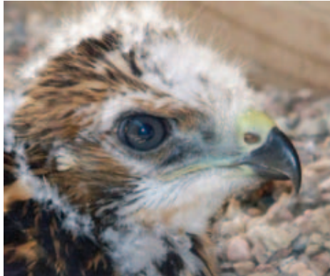
Bedraggled Swainson's survives the rain.

Because of you, the eagle with the broken shoulder blade had a