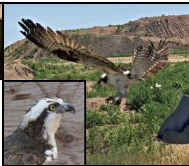
Right: Healed from his ordeal, the Osprey was released back to the wild.