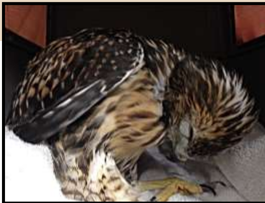
Left: This Red-tailed Hawk, brought down by West Nile Virus, was saved by those who love and support wildlife through the RMRP.

Thank you for saving these wounded warriors. Their freedom is your greatest achievement!