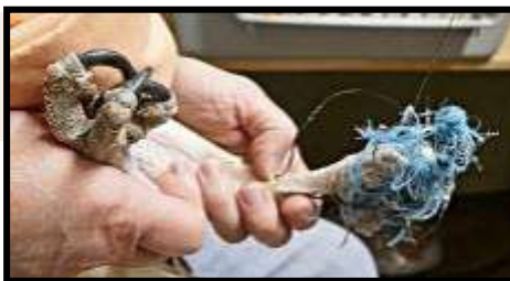
Above: Osprey's foot completely bound in baling twine.

How you can help: Remind everyone to pick up their twine! There are many places that twine can be recycled. Just Google “Baling Twine Recycling” and your city. Save an Osprey!