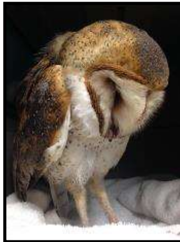
Above: Barn Owl severely pummeled by soft-ball sized hail. She was returned to the wild after a month of healing.

Our critical care unit was beyond full with young birds healing from serious fractures and terrible trauma from soft-ball sized hail.