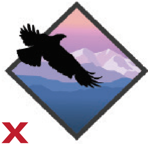
low resolution image (will look fuzzy when printed)

If you're not sure if the file(s) you have will work, send over what you have and we can take a look at them.