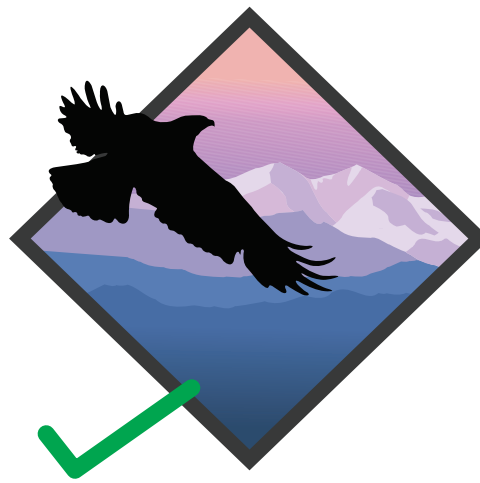
vector/ high resolution image (will look crisp and clean when printed)

Are your files too large to attach in an e-mail? Use www.wetransfer.com !