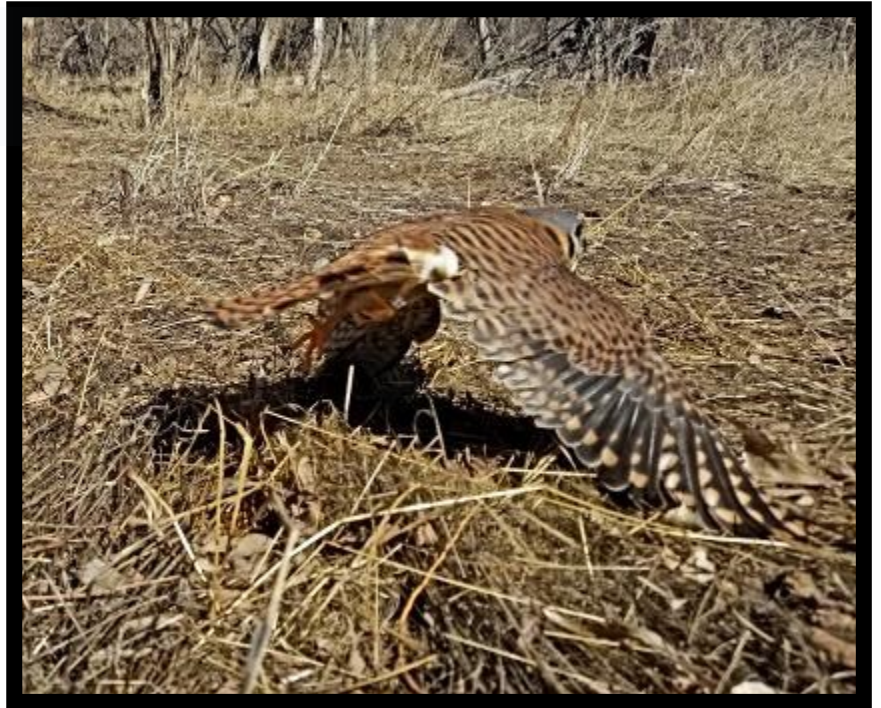
Above: American Kestrel released in early March after recovering from general trauma. She is but one of the around 300 raptors the RMRP expects to care for this year.

We expect the caseload to pick up soon. We are projecting another 300 sick and injured raptors will come through our doors this year. We ready ourselves to care for them, no matter what the challenge.