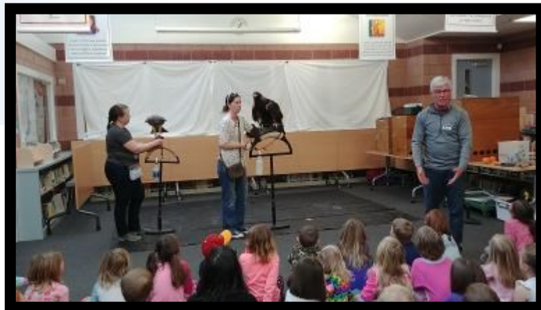
Above: RMRP typically gives an education program nearly every day in April. Due to school closures, many, if not all, education programs will be cancelled in April 2020.

These concerns will continue as long as COVID-19 continues to be a hazard in our country. It is in the best interest of everyone to not gather in large groups, practice social distancing, and stay at home as much as possible. Many of our beloved supporters are affected by these closures as well—losing their livelihood as restaurants and businesses have closed due to coronavirus. This may affect donations and how the RMRP will operate in the coming months.