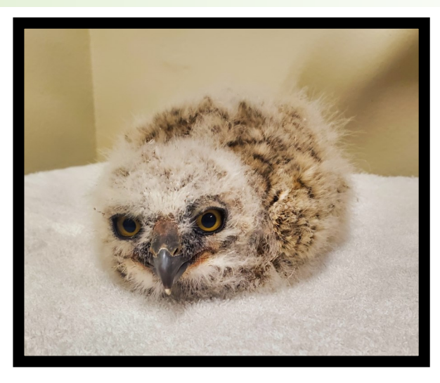
This little nestling Great Horned Owl was found after falling from its nest. It has a fractured wing that is healing and will hopefully be released this fall.

If all goes well, both will be released to the wild this fall.