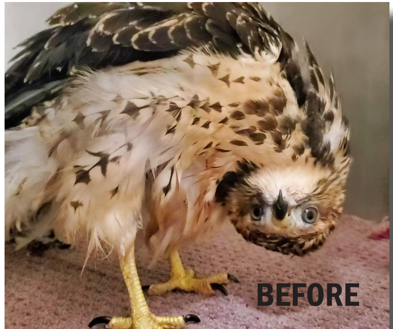
Above and Right: This Swainson's Hawk had physical therapy and medication to improve his torticollis (twisted head).

The young Swainson's is doing well and he will overwinter at RMRP. We hope he continues to improve and he can be released at the end of next summer for his first migration to Argentina!