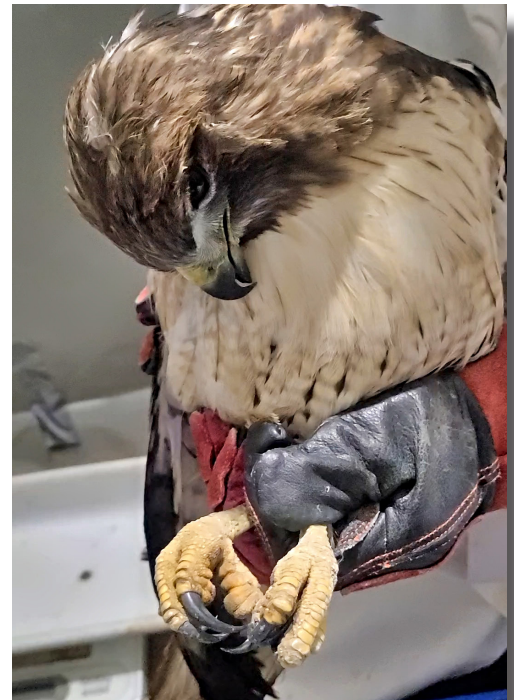
Above: This Red-tailed Hawk struggles with the seizures caused by Highly Pathogenic Avian Influenza.

With gratitude and hope, The RMRP Rehabilitation Team