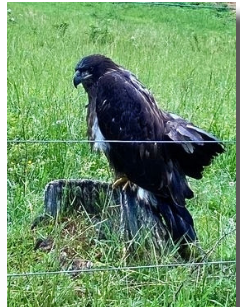
Above: Young Bald Eagle injured on the side of the road in West Virginia. His injuries left permanent disabilities so he found his forever home at RMRP!

The new arrival Ambassador Eagle has since begun a specialized training plan, developed just for him, to help him learn the skills he needs to be a confident and comfortable Educational Ambassador.