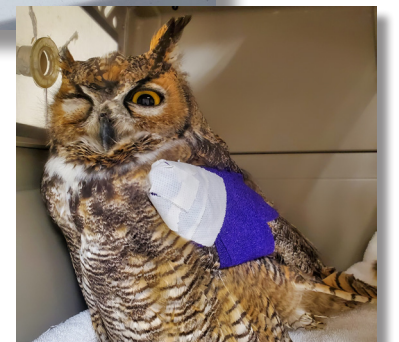
Above & Right: This Great Horned Owl hit the grill of a truck so hard it broke - and so did the owl! It took many months of healing and care for this owl to return to the wild.