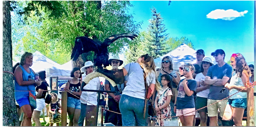
Above: Our donors, partners, and sponsors helped our conservation message reach over 44,000 people in 2022.