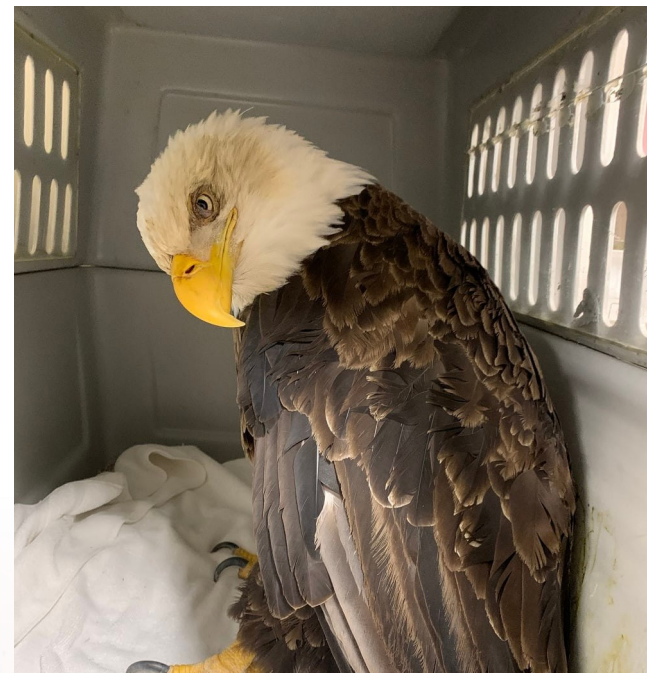
Above: Bald Eagles love to scavenge, and will eat anything leftover from other animals or human hunters. If a hunted animal was shot with lead shot, the eagle can be poisoned by the lead. This Bald Eagle had a high lead level, but lots of medication and care saw it return to the wild.