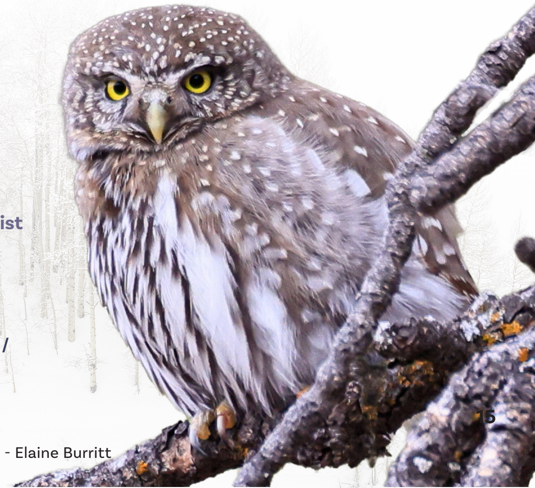
Northern Pygmy Owl - Elaine Burritt