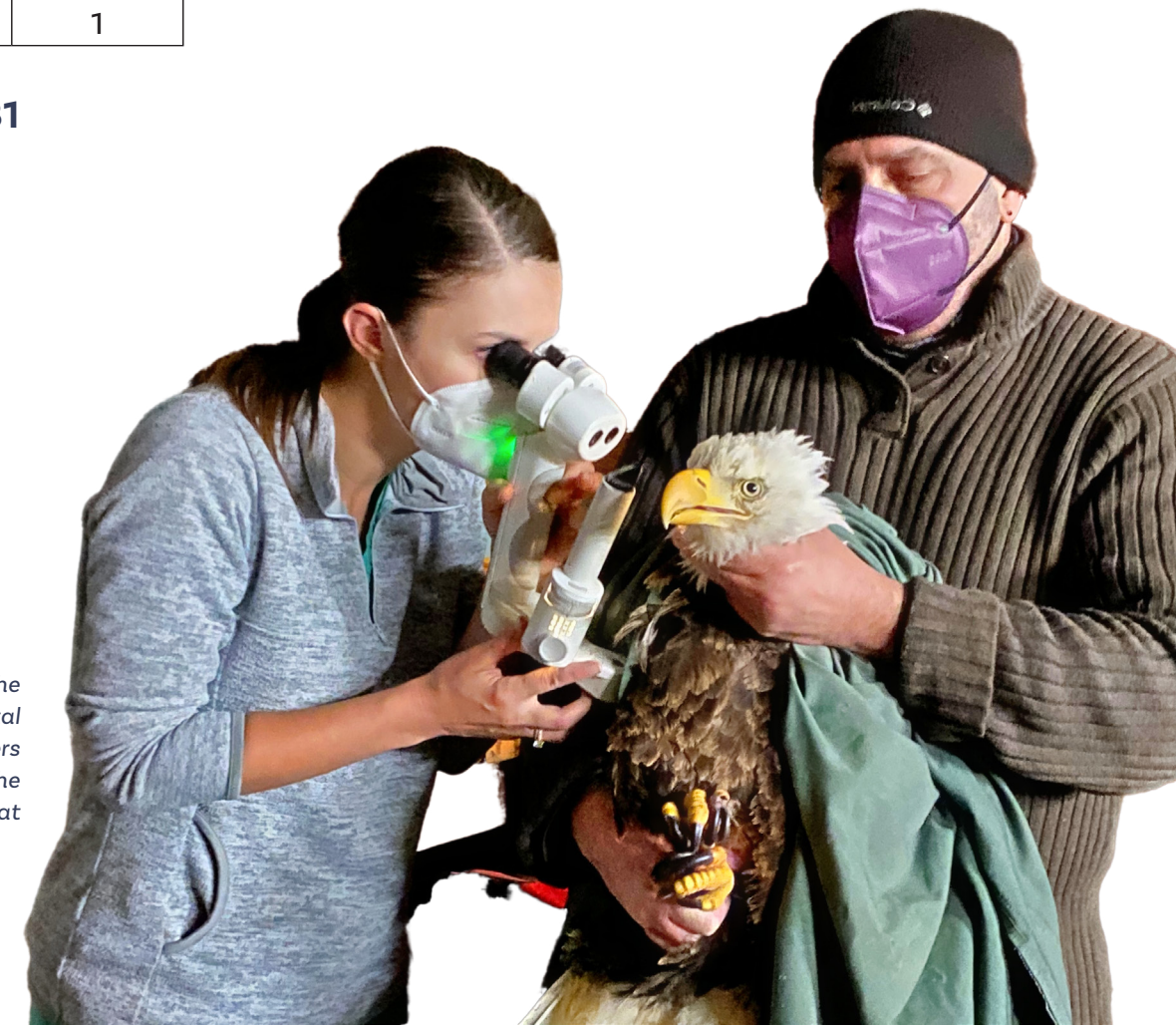
Right: At a reduced cost to RMRP, the CSU Veterinary Teaching Hospital Ophthalmology Department partners with RMRP to give students the opportunity to diagnose and treat eye conditions in raptors.