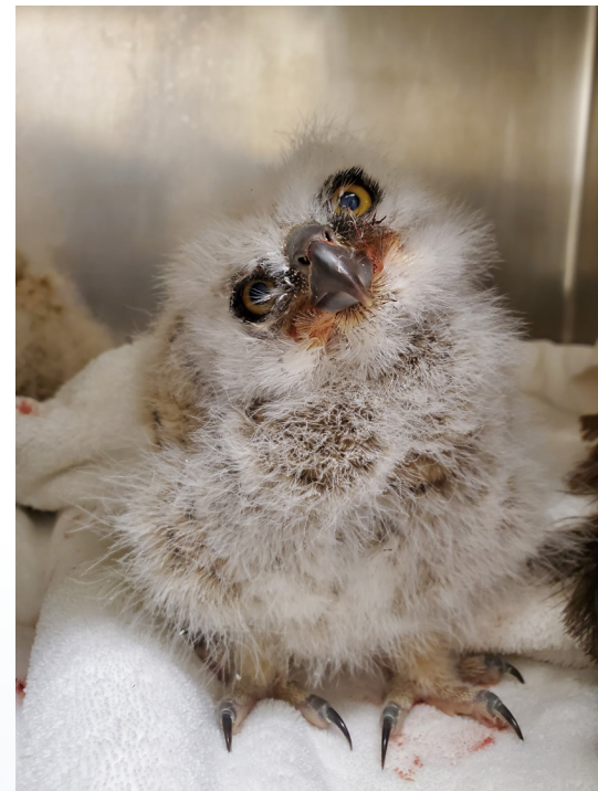
Above: This baby Great Horned Owl's nest was destroyed in a storm. The little one suffered head trauma from the fall, but was released back to the wild after growing up at RMRP.