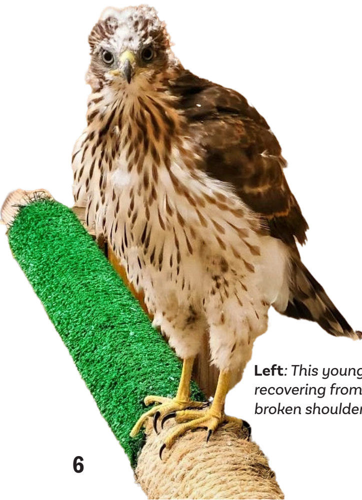
Left: This young Cooper's Hawk is recovering from leg paralysis and a broken shoulder blade.

All of them thank you for your support that gave them a Second Chance at Freedom.