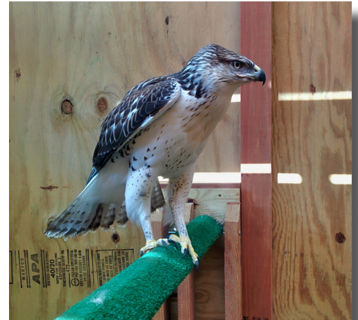
Above: This Ferruginous Hawk is currently recovering from starvation and trauma.

With your support, this Ferruginous Hawk is continuing through its recovery and we hope for its return to the wild for A Second Chance at Freedom.