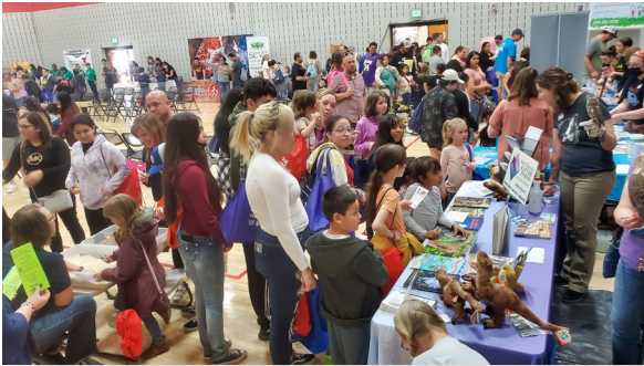
A single event can reach thousands of people!