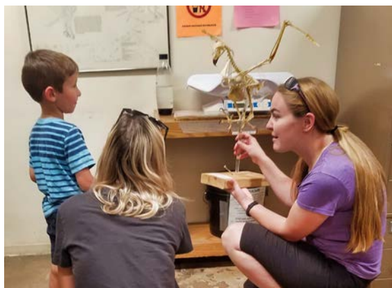
Above: Join us for the Open House and have fun learning!

The Rocky Mountain Raptor Program celebrates World Migratory Bird Day, mothers, spring and the “baby season” with an Open House from Noon to 4p.m. on Saturday, May 10, 2025 (the Saturday before Mother’s Day). Visitors will learn how more than 300 feathered birds of prey receive specialized hospital care each year so they can return to the skies, and how foster parents raise orphans. Educational Ambassador raptors will be on display to offer an up-close and exciting experience. Join us for the fun!