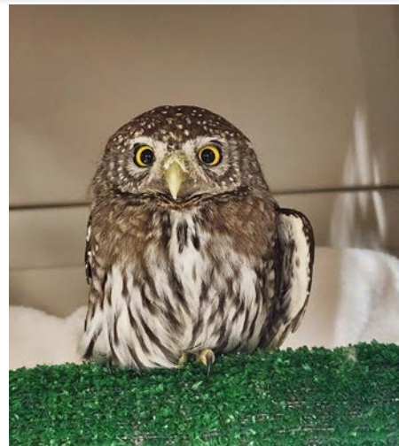
Above Northern Pygmy Owl heals after flying into a window.