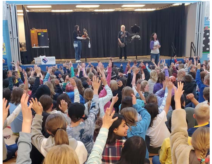
Above: Dozens of students excitedly interact with our educational programs. Our programs inspire audiences from kindergarten through doctoral students.

64,838 total people experienced the majesty of raptors.