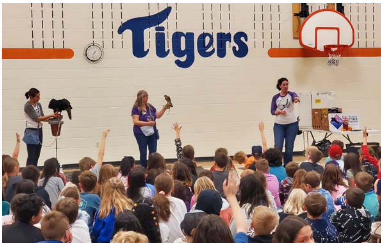
Above & Right: A small but indispensable group of 20 hard-working Educational Ambassador raptors work tirelessly to provide inspiration for humans of all ages to be a part of the fight to preserve wildlife and wild places. Volunteer handlers provide medical and husbandry support every day of the year.