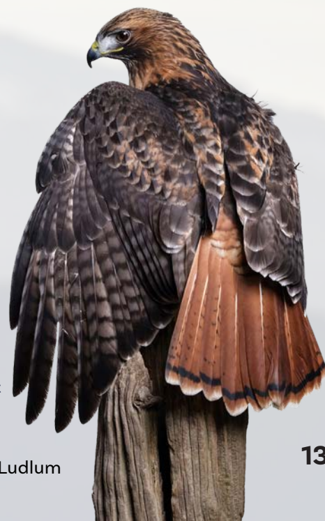
Red-tailed Hawk