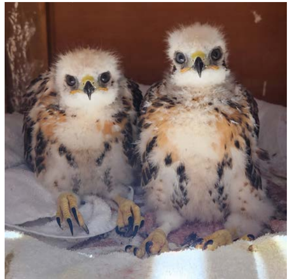
Above: These two baby Swainson's Hawks lost their nests due to severe storms. Within a matter of months, they touched the skies again.