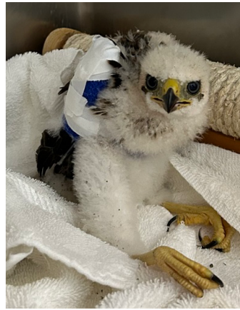
Above: This banged-up Cooper's Hawk came in with a fractured humerus. Sped through flight training and mouse school and was released on August 15.

West Nile Virus hit especially hard this year. Young birds with weaker immune systems were bitten by infected mosquitoes, leaving many too weak to eat or fly. Of the 62 raptors admitted, 25