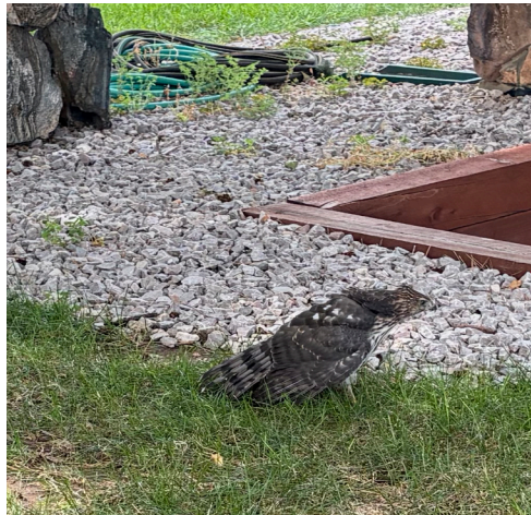
Above: The Cooper's Hawk is deciding what to do next with his meal.

PS: If you'd like to donate or volunteer to help the Hughes For Everyone Campaign, please call or email me. Together, we can make Hughes a place for people to connect, conserve, and recreate, and where wildlife thrives.