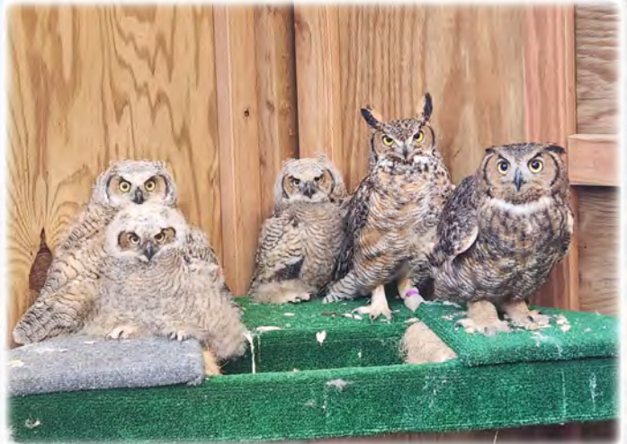
Above: These young owls were displaced from their nest, but RMRP’s adult foster parents stepped in to teach them all about being an owl.

Give today to help the next young raptor take flight.