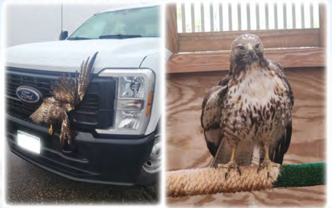
Above: A devastating injury turned to hope.