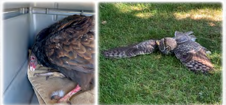
Our hearts break when we see a majestic raptor shattered by Highly Pathogenic Avian Influenza. This deadly virus continues to affect wild birds across the country, and even the strongest eagles, hawks, and owls can fall victim. Every case reminds us why disease monitoring, biosecurity, and public awareness are so vital to protecting raptors and all wildlife.

Thank you for being the reason RMRP - and the birds we protect - can face whatever comes next.