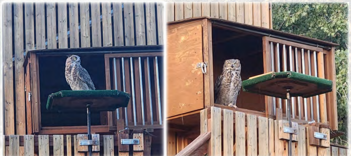
Above: This owl came in as a nestling, and after a few months in our care, passed flight and rat school with flying colors! Here, the owl is surveying the land before taking off from our soft release enclosure.