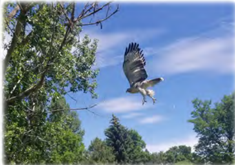
Above: We never tire of seeing them fly away.

Thank you for being the reason wild lives can return home.