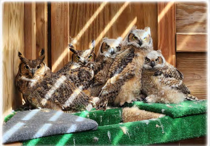
Above: Fledglings at 2 months old and molting off their baby fluff.